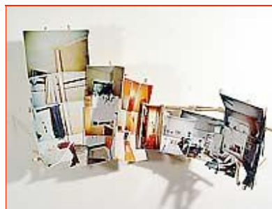
enlarge Isidro Blasco's "Poet," 2004, c-print, museum board, wood and hardware, is also part of the exhibit.

Aloneness isn't a problem in the lighthearted performance/installation by flatchestedmama (aka Amy Ellen Trefsgger). Trefsgger has set up a narrow bed and a few belongings in the storefront window and moved into CoCA for the duration of the show. That means she sleeps — or tries to — in full view of all the neighborhood's illicit nighttime activities (Hudgins says it's quite a scene.) Trefsgger's statement maintains she's living with art as a try-out before formally marrying her "creative self." Assuming she doesn't back out, the wedding will be held Sept. 18.